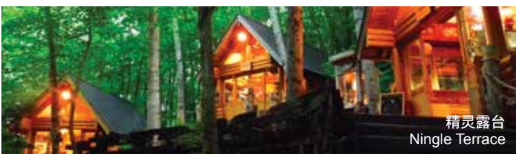
精灵露台 Ningle Terrace

住宿: Asahikawa Art Hotel or similar(当地 4 星级酒店)